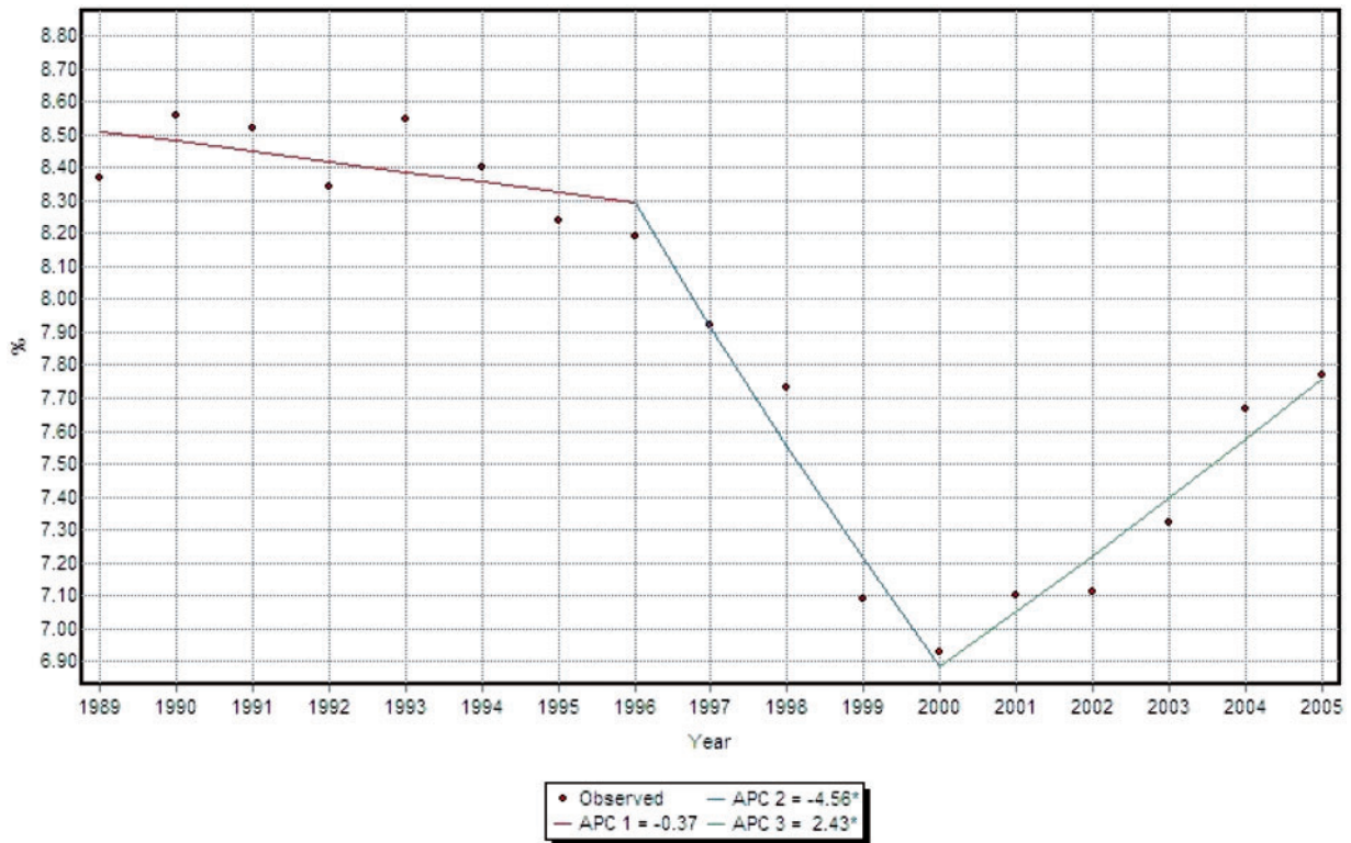
Figure 3. Hospitalization rates of injuries (age-adjusted/100 000 persons) in Massachusetts, 1989–2005.

age groups unlike the rates among the relatively young COPD patients. Such observations are consistent with the natural history of COPD among smokers. The reported steady increase in COPD death rates across the whole of the USA, with declining hospitalization rates, suggest that the observed decline is most likely not related to a lower prevalence of severe COPD among the population. 12,21 Nevertheless, similar trend analyses in geographic areas with and without a comprehensive tobacco control program are worth considering.